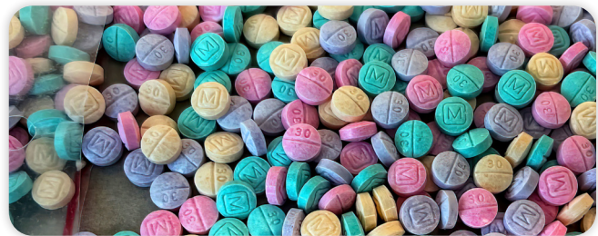
*FAKE rainbow oxycodone M30 tablets containing fentanyl